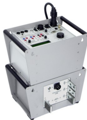
PCU1-SP and NLU5000

The unit has two outputs, allowing injection of currents as low as a few hundred milliamps and up to 750A. Voltages up to 16V are available on the 40A output, allowing higher impedance trips to be tested. Four true RMS metering ranges are provided, allowing the full scale of the meter and trip level to be set independently of the selected output. The metering has a capture time of less than 20ms, allowing the rms of a single cycle to be accurately measured. Industry standard connectors are used on all inputs and outputs for convenience, reliability and safety.